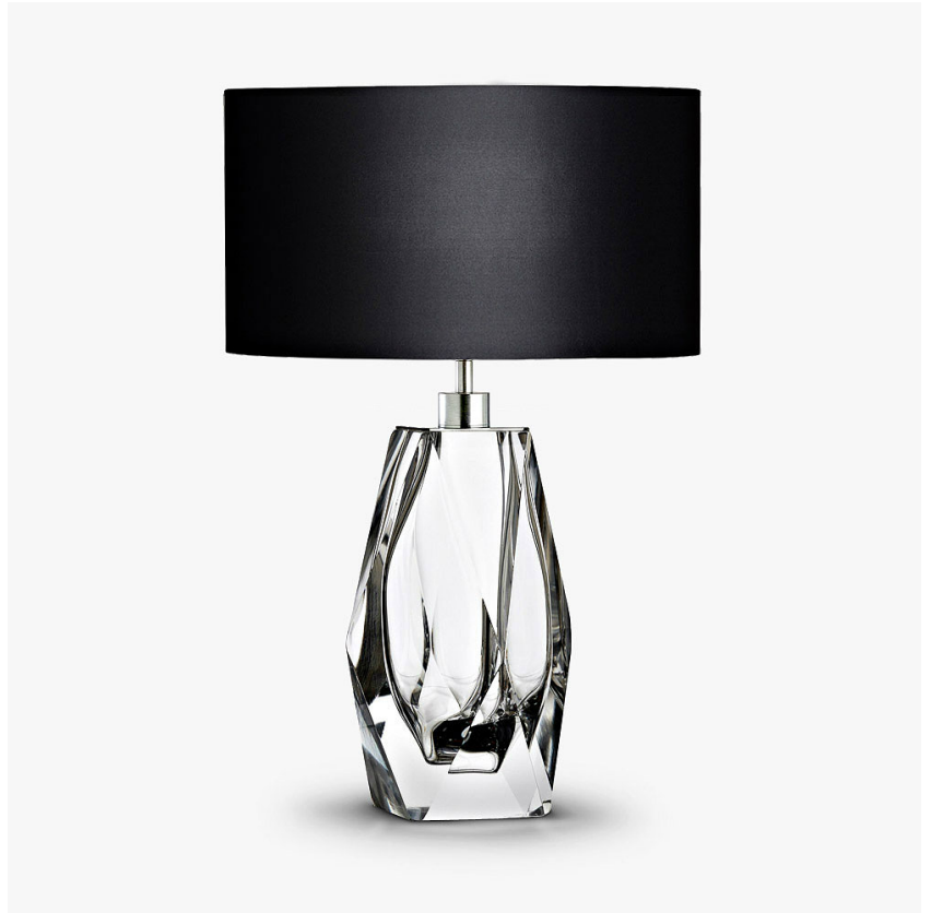
TL701 in Clear Murano Glass and Brushed Nickel with a 15" Oval Shade in Silk Crepe Satin 1806W-52 Black