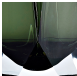
Forest Green & Clear