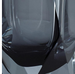
Slate & Clear