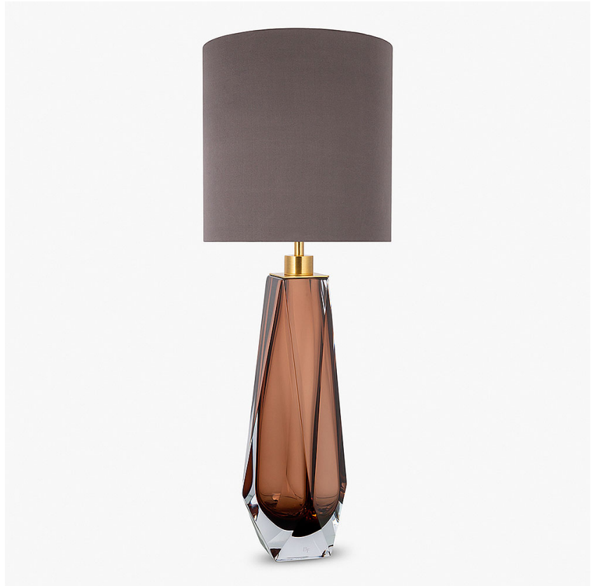
TL702 in Tobacco & Clear and Brushed Gold with a 11" Tall Drum Shade in Bennett Silks Dupion Silk 5018W-86 Prussian