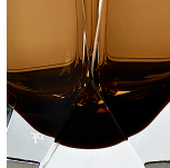
Tobacco & Clear