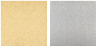
Brushed Gold Brushed Nickel