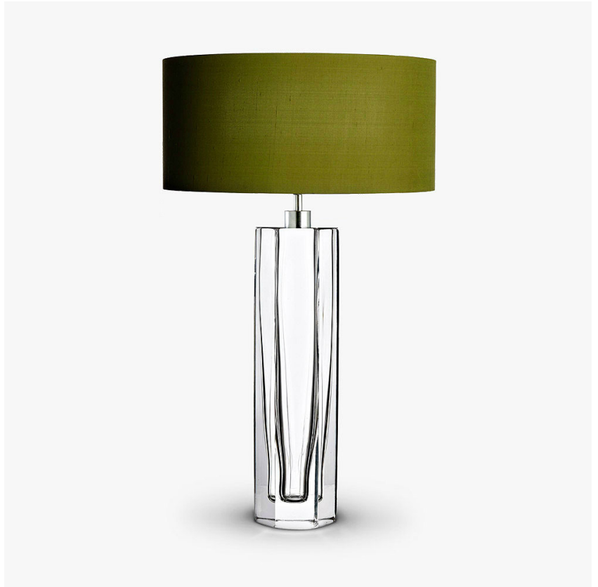
TL704 in Clear Murano Glass and Brushed Nickel with a 16" Short Drum Shade in 5018W-202