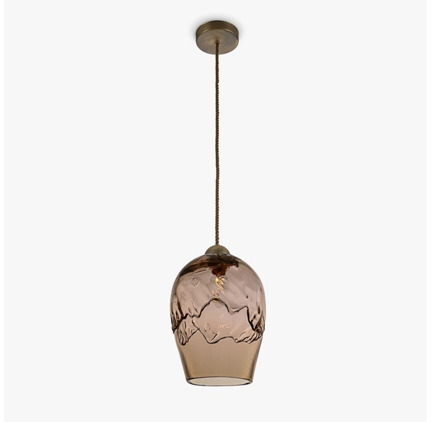
CL238 in Bronze Glass and Brushed Dark Bronze with Brown Flex