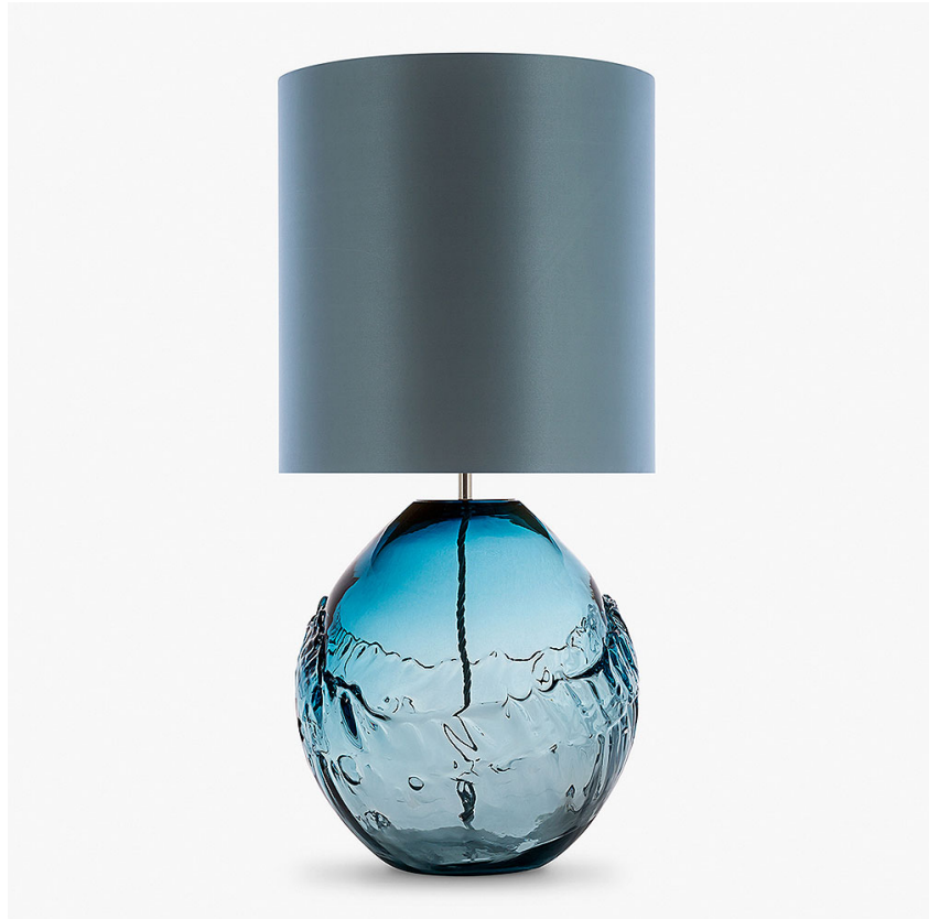
TL238 in Ocean Blue Glass and Brushed Nickel with a 12" Tall Drum Shade in Crepe Satin 1806W/0312 Mist