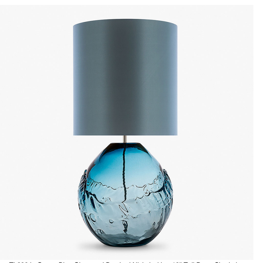
TL238 in Ocean Blue Glass and Brushed Nickel with a 12" Tall Drum Shade in Crepe Satin 1806W/0312 Mist