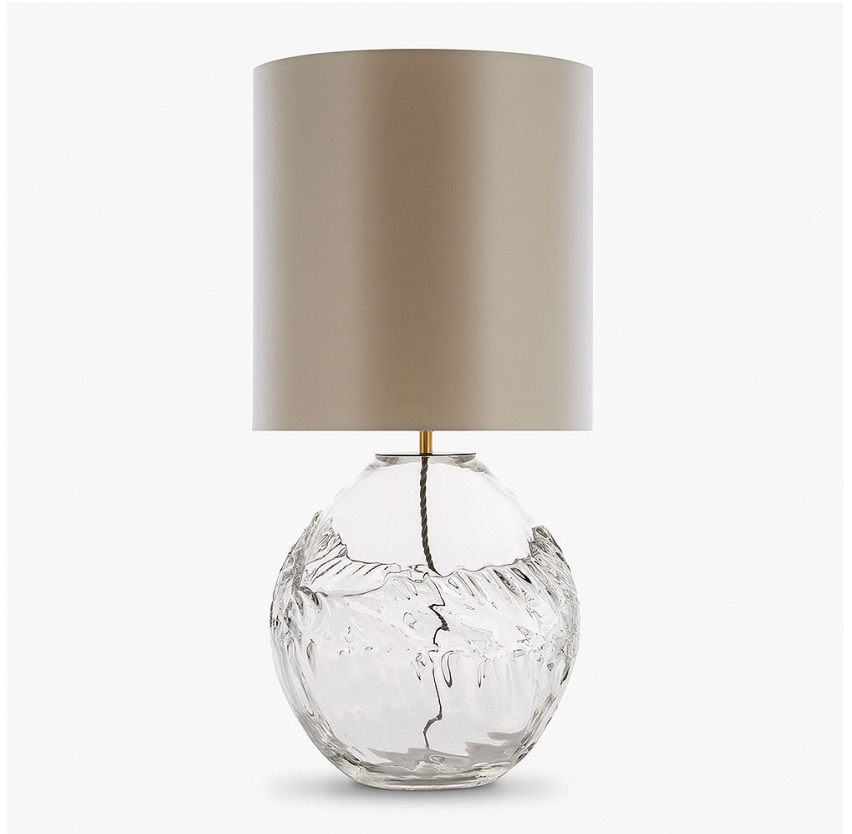
TL238 in Clear Glass and Brushed Gold with an 12" Tall Drum Shade in Crepe Satin 5018W/4501 Platinum