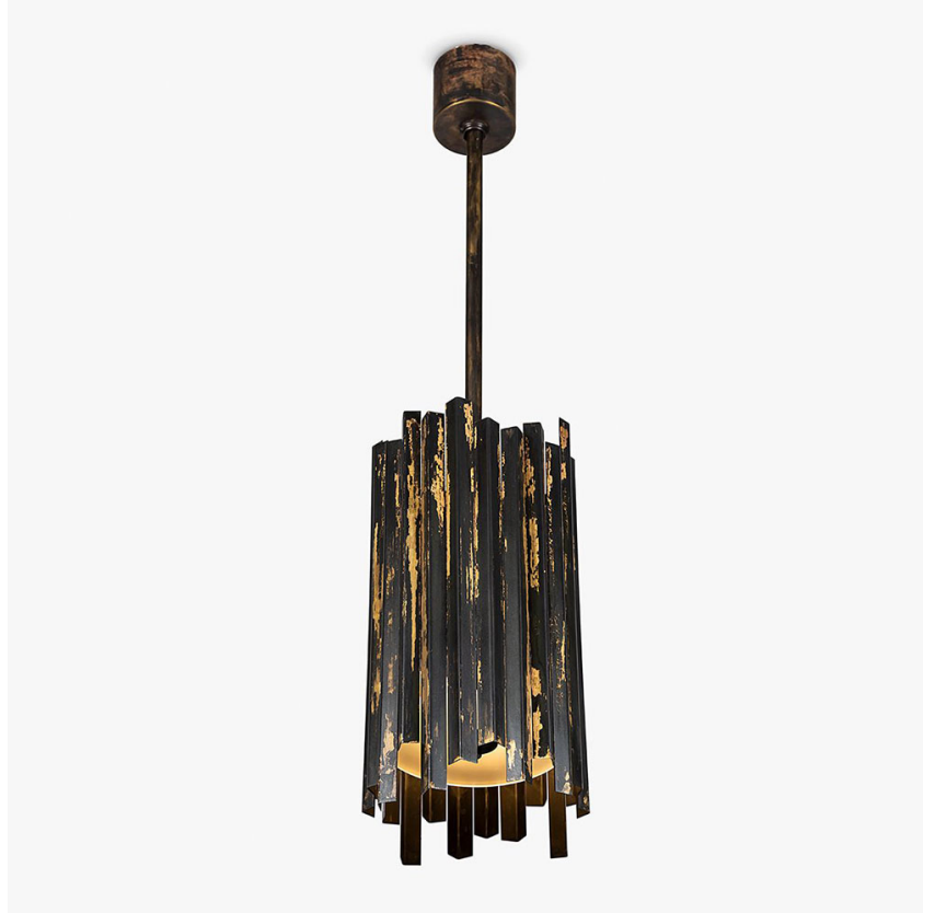
CL114-PEN in Distressed Bronze with a Lucite Diffuser