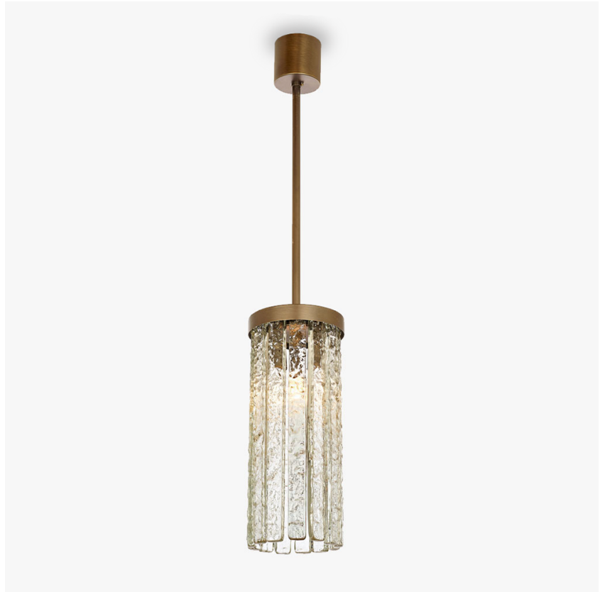
CL455 in Clear Hammered Murano Glass and Brushed Dark Bronze

UL (Underwriters Laboratories) test certificates available for the USA - will incur a surcharge