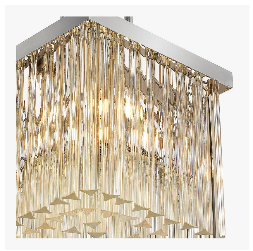
CL454 in Clear Triangular Flat Cut Murano Glass Rods and Chrome

IEC (International Electrotechnical Commission) test certificates available - will incur a surcharge UL (Underwriters Laboratories) test certificates available for the USA - will incur a surcharge