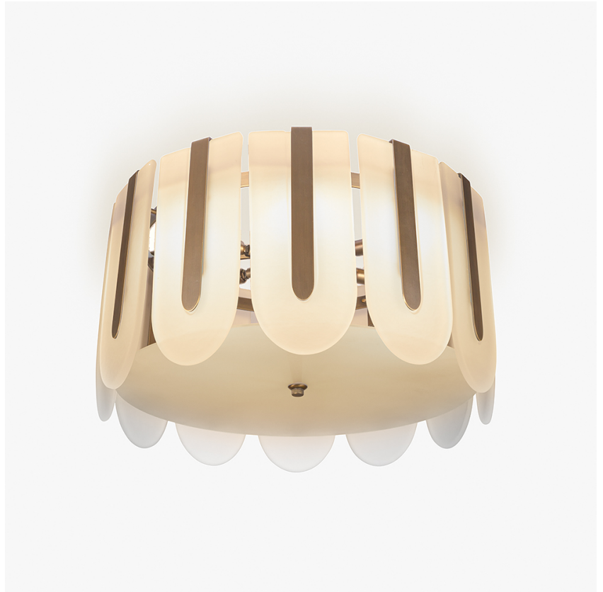
CL205-FM with Satin Glass and Brushed Gold