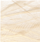
Clear Hand-Carved Lucite