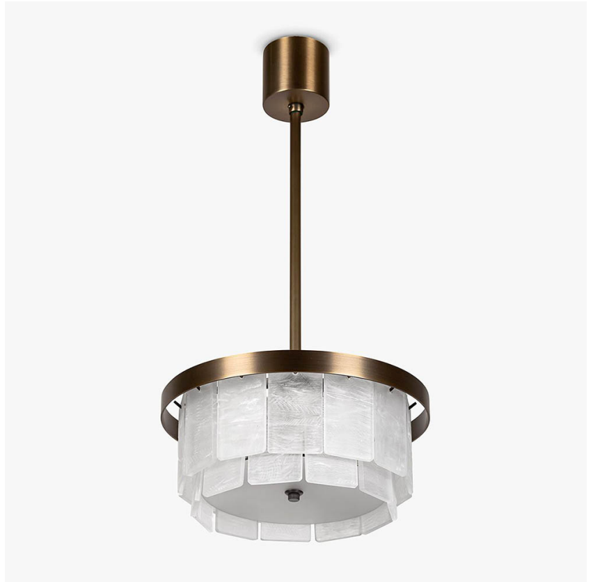
CL125-PEN in Clear Hand-carved Lucite and Brushed Dark Bronze