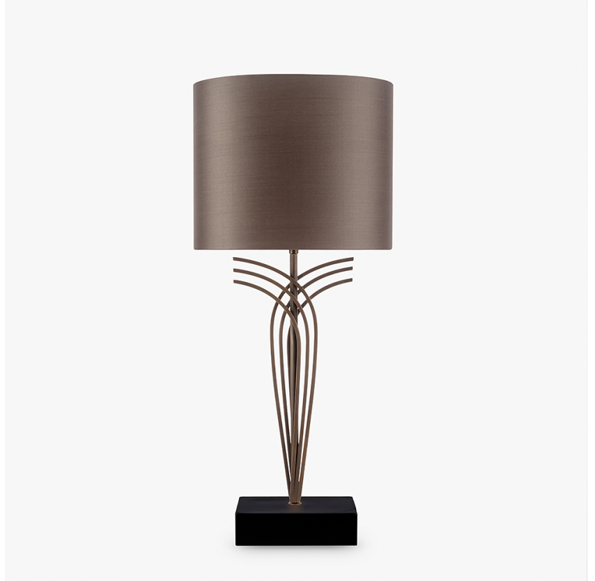
TL209 in Brushed Dark Bronze with a 12" Oval 38000/136 Manta Ray