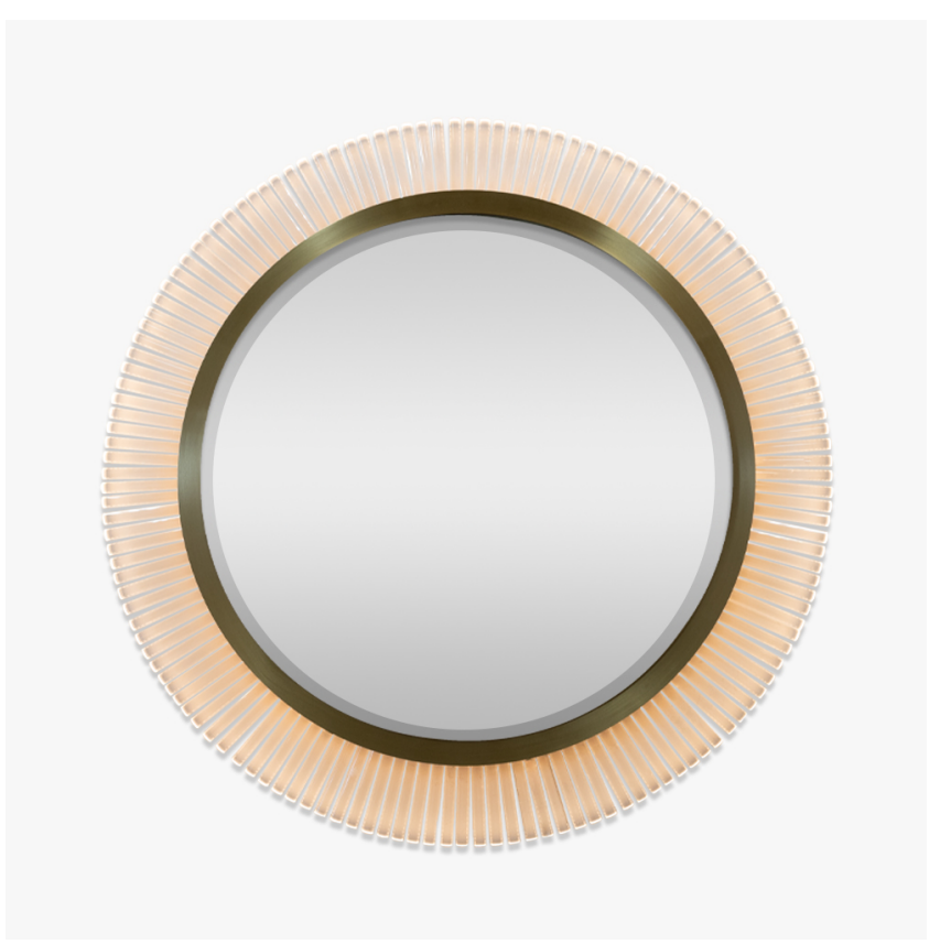
Belgrave Square Straight LED Mirror in Brushed Gold and Clear Lucite

Comprised of sporadic or straight Lucite rods, this mirror is another contemporary addition to the Belgrave Square family from the Mayfair Collection. This ornate mirror can be lit by a long LED strip positioned above the Lucite rods to create a beautifully warm lighting effect which reflects off the distressed glass.