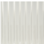
Clear Lucite Rods