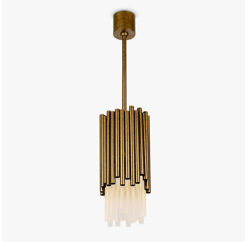
CL109-PEN in Frosted Lucite Rods and Stippled Gold Rods

IEC (International Electrotechnical Commission) test certificates available - will incur a surcharge