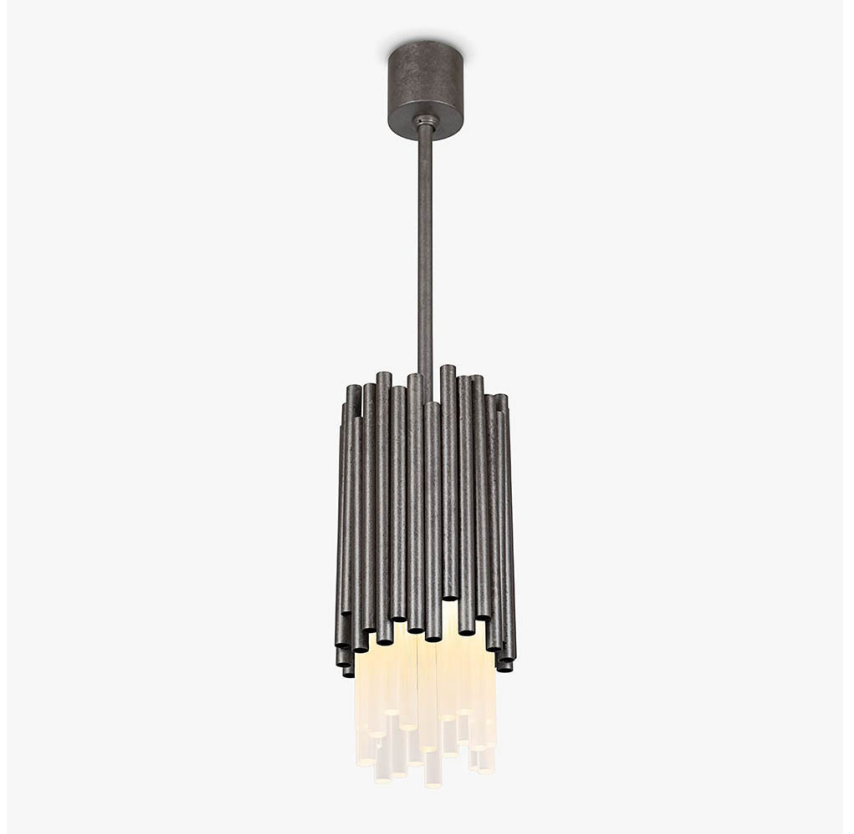
CL109-PEN in Frosted Lucite Rods and Stippled Silver Rods

IEC (International Electrotechnical Commission) test certificates available - will incur a surcharge