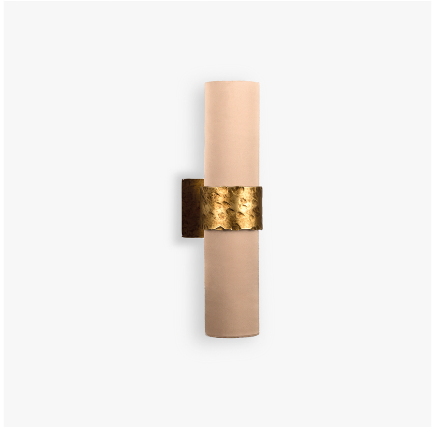
WL57 in Hammered Antique Gold and WL57-Shades in Crepe Satin 1806W-012 Frosted Almond