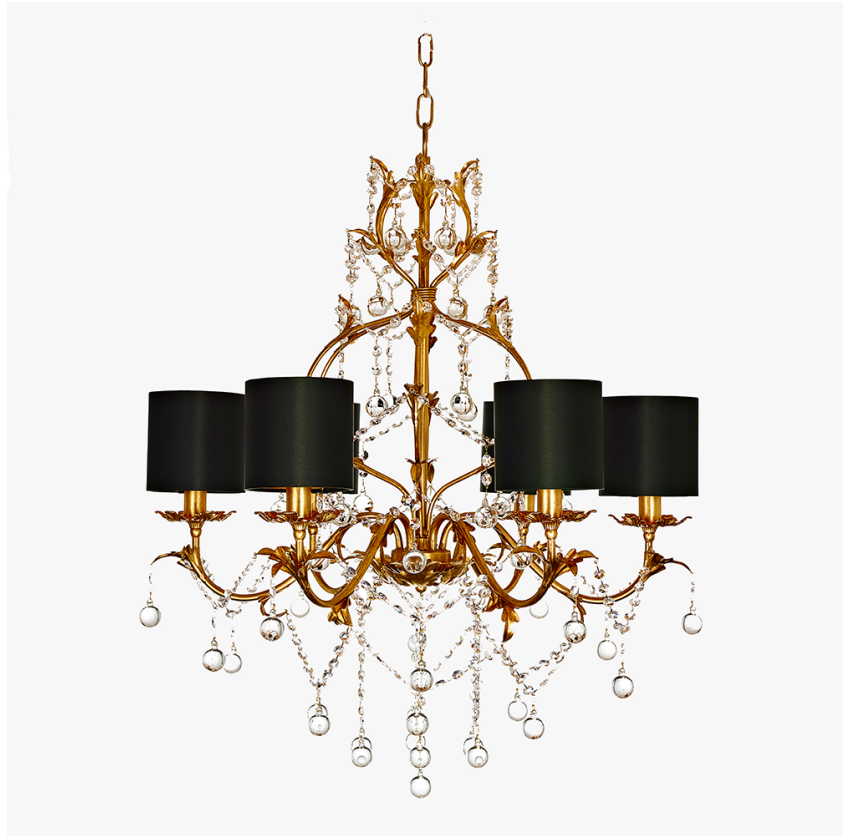
CL77-6 in Antique Gold with 5 Inch Shades in Crepe Satin 1806W/

IEC (International Electrotechnical Commission) test certificates available - will incur a surcharge UL (Underwriters Laboratories) test certificates available for the USA - will incur a surcharge