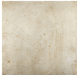
Antique Silver Leaf