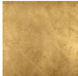
Antique Gold Leaf