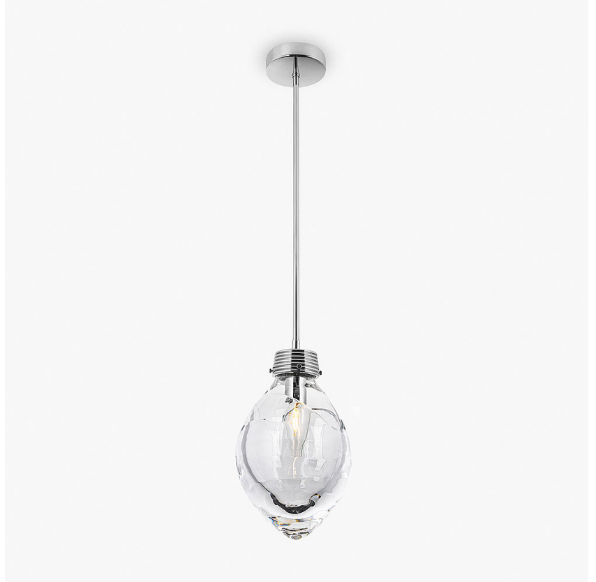
CL660-PEN in Clear Glass and a Polished Nickel Rod

Joining the Acorn family, the new Acorn pendant is a delicate design, each one is wrapped in a generous layer of glass, creating an abstract glass ribbon. Hand-crafted in our glass workshop in Britain, available in clear glass only, with either a rod or flex cord.