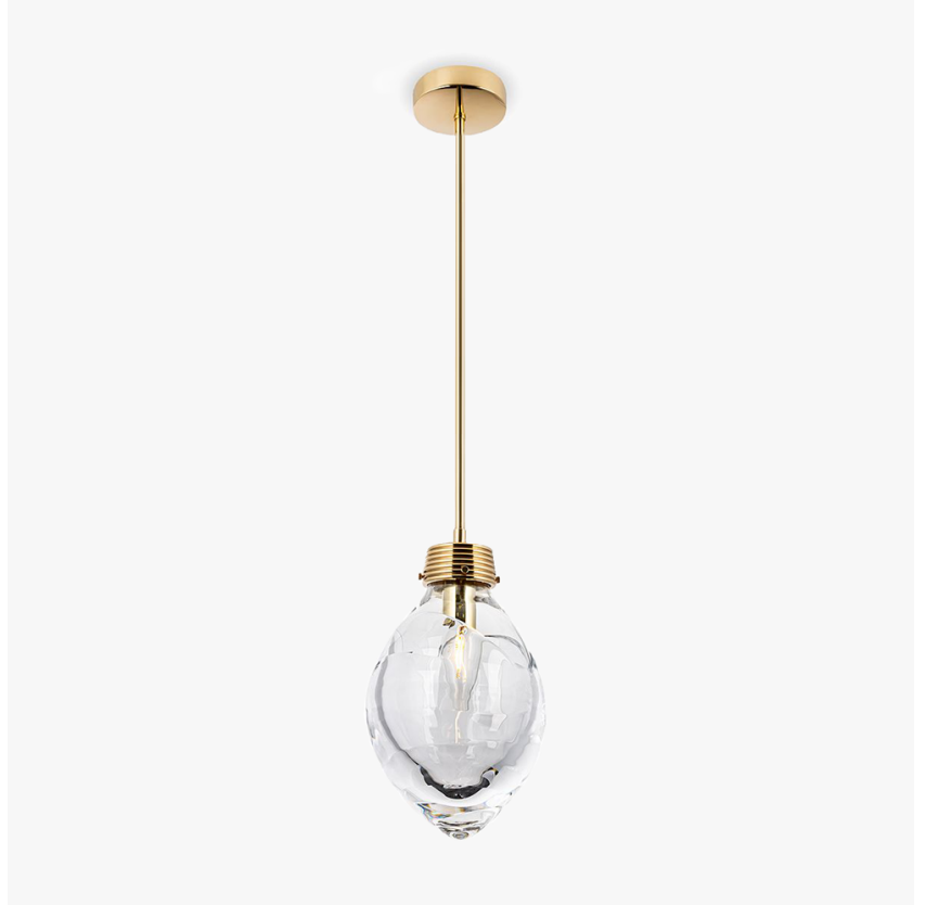
CL660-PEN in Clear Glass and Polished Brass

Joining the Acorn family, the new Acorn pendant is a delicate design, each one is wrapped in a generous layer of glass, creating an abstract glass ribbon. Hand-crafted in our glass workshop in Britain, available in clear glass only, with either a rod or flex cord.